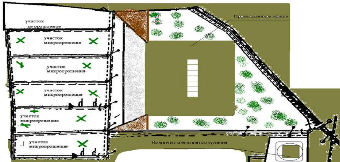
FIGURE 1: Scheme of the irrigation sprinkling station on the experimental part of the Tertersky RWCN in the Garabagh land in the period 2006-2010 with the use of the Idad and MDR sprinklers:

Studies on sprinkling in this facility have shown that the rainfall in the IDAUD (3 mm / min) is greater than the rate of water absorption into the soil of the research object. Therefore, when feeding 500 m 3 / ha, puddles and surface discharges were formed at the site.