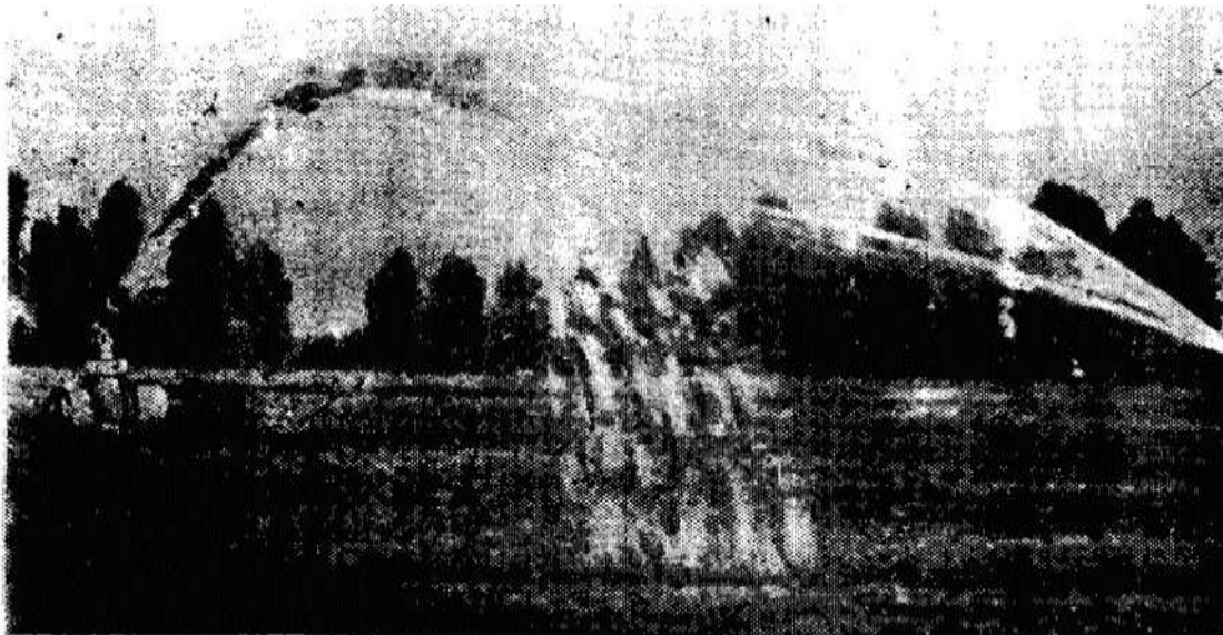
FIGURE 2: Demonstrations of the micro irrigation regime with the use of IDAH in conditions of irrigation of sugar beet, maize for power and soya in the Terter AIS of the Institute of "Agriculture".

The discharge was 20-30%, which led to uneven moistening. At the beginning of vegetation due to timely treatments, the surface discharge decreased (up to 8-10%). When the treatment of crops ceased, the discharge again reached 16-17%.