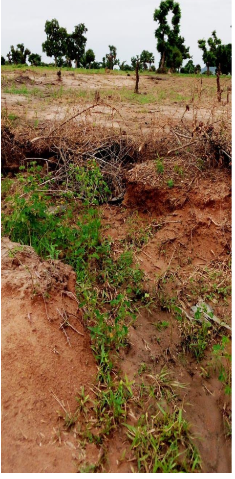
PLATE I: A Secondary School Degraded by Gully Erosion in Pakka, Maiha Local Government Area.