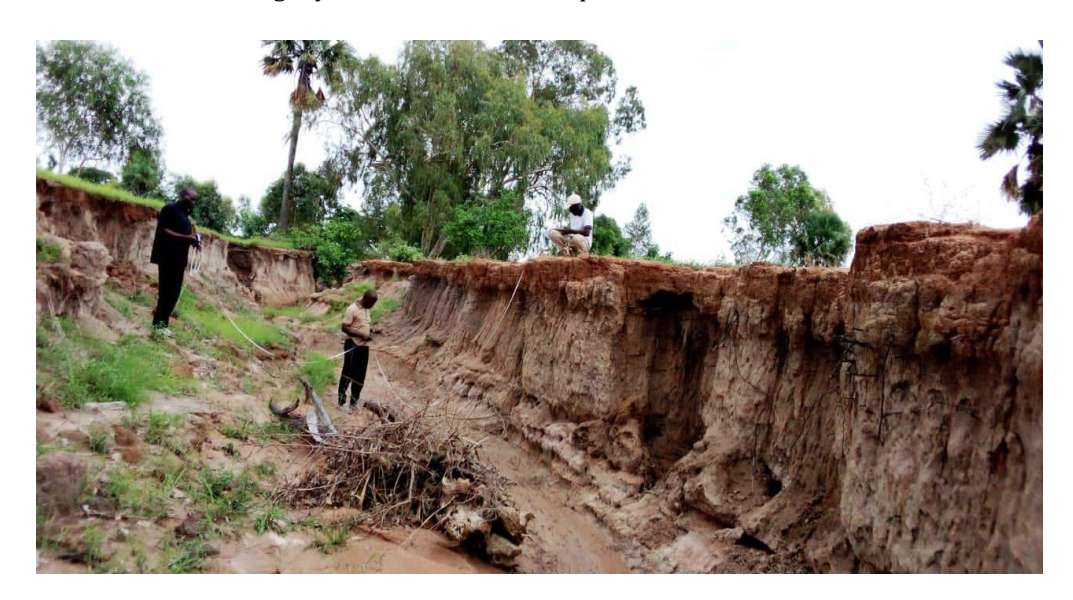
PLATE III: The Nature and Intensity of Gully Erosion Development in Kirya, Mubi North Local Government.

The perception of the respondents on the threats of gully erosion on the farming activities in the Northern Adamawa state was assessed. The data in the Table 7 shows that 33.3% of the respondents seriously loss their farmlands to gully erosion. 20% of the respondents indicated that they Loss their soil quality. However, 12.5% of the respondents also said that they experience serious increase in crop transportation cost. While, 9.2% of the respondent were of the opinion that they loss their income as a result of gully erosion. It is also revealed in Table 7 that 8.3% of the respondents experience huge increase in labour cost as an effect of gully erosion. Also, 7.5%, 5.4% and 3.8% said that they experience loss of crop productivity, loss of cultural heritage and loss of social value respectively due to gully erosion. The above finding reveals that there is a great threat experienced by the farmers in Northern part of Adamawa state as a result of gully erosion. This finding also reveals that the farmers experienced increase in the cost of transportation as a result of loss of access road due to gully erosion threats as on plate iii bellow.